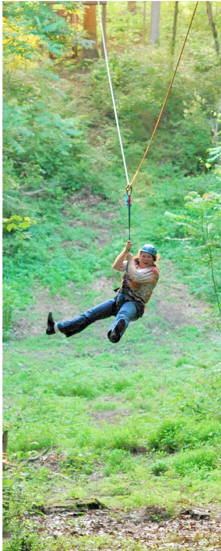
Riding the zip line!