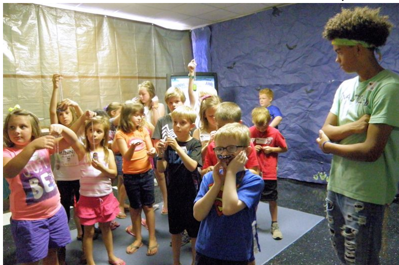
The children had a great time all week!