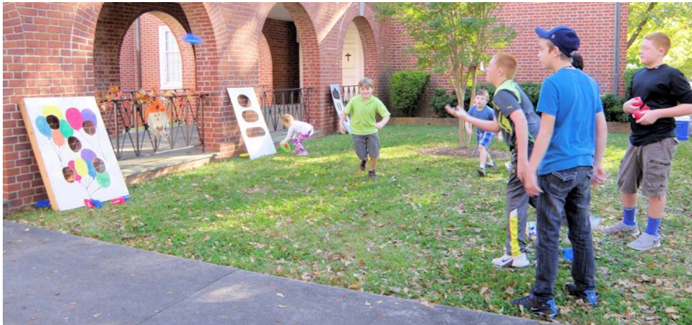
Bean bag toss at the 2014 picnic

6:00 PM , Talent Show, Fellowship Hall. Acts are limited to no more than 5 minutes each.